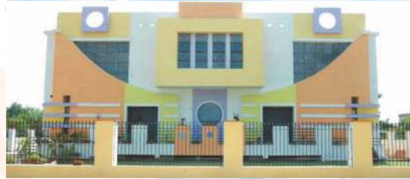
SEEDLING SCHOOL NURSERY BRANCH (UDAIPUR)