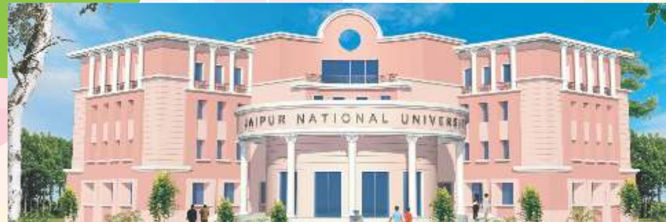
JAIPUR NATIONAL UNIVERSITY (JAIPUR)