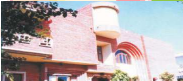
SEEDLING NURSERY SCHOOL (JAIPUR)