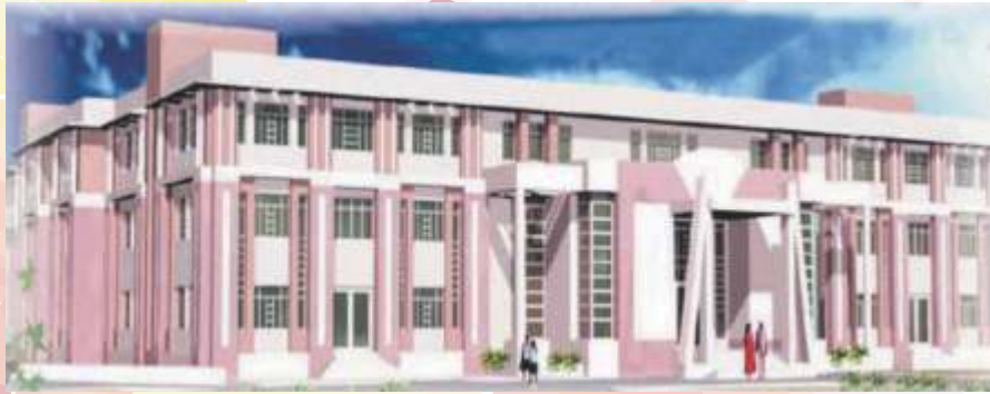
SEEDLING MODERN PUBLIC SCHOOL (UDAIPUR)